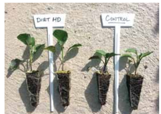
Brassica - 53 days post germination